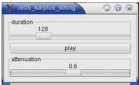
Figure 3: Screenshot of the Karplus-Strong example generated with the jack-gtk.cpp architecture

foo = hslider("duration", 128, 2, 512, 1); faa = hslider("duration", 128, 2, 512, 1); process = foo - faa;